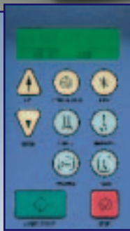
Easy-to-read LCD display