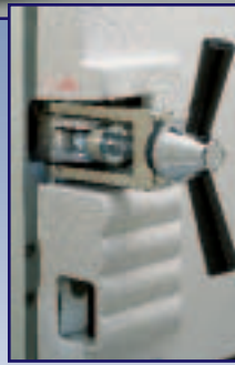
Triple door lock ensures safety