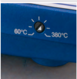
Redundant temperature control system with user-defined over temperature set point.