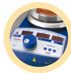
RT Series Sleek and sophisticated design pg. 7