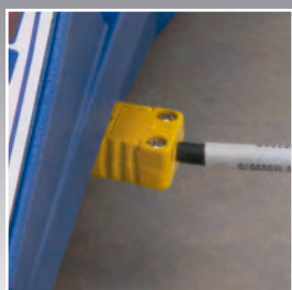
Flexible remote temperature probe provides versatility for virtually any application.