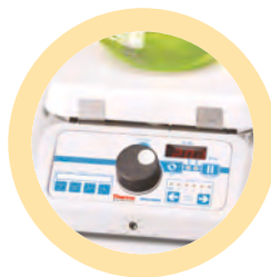
Super-Nuova Series Unparalleled performance and control pg. 5