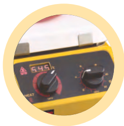
Cimarec Series Exceptional accuracy and value pg. 2