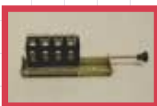
4-position 10mm cuvette holder (P/N 1200-103)