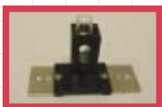
10 mm single cuvette holder with base. (P/N 1200-102)