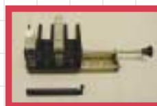
Longpath cell holder for up to 50mm longcell (P/N 1200-104)