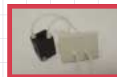
Water jacketed cell holder with base (not shown) and panel (P/N 1200-105)