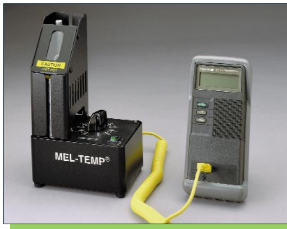
Model 1006 Show with Mel-Temp