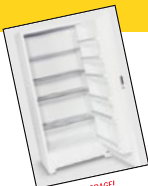
SAFE COLD STORAGE!