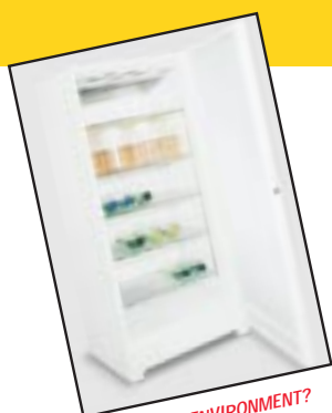
HAZARDOUS ENVIRONMENT? SAFETY FIRST!