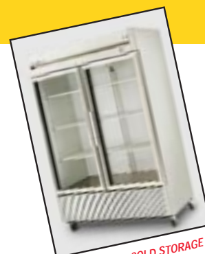
OUR LARGEST COLD STORAGE UNITS!