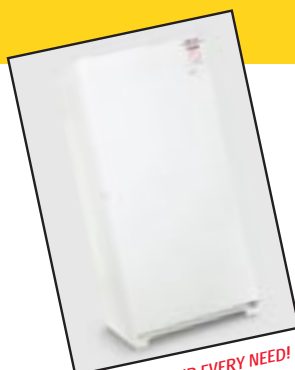
SIZES FOR YOUR EVERY NEED!