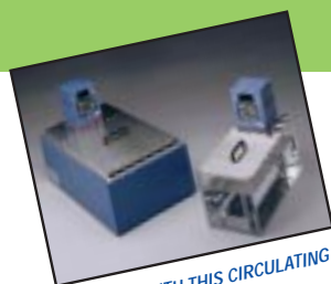
DO IT ALL WITH THIS CIRCULATING BATH!