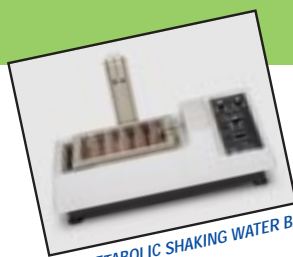
THE METABOLIC SHAKING WATER BATH!