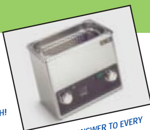
THE PERFECT ANSWER TO EVERY CLEANING PROBLEM!