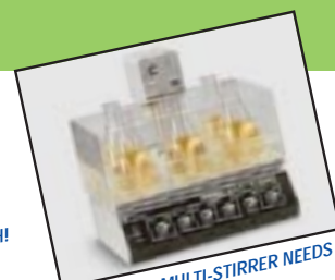
WHEN YOUR MULTI-STIRRER NEEDS TO TAKE A BATH!