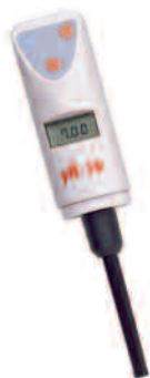
Chek-Mite pH-10 Measures pH

Please see the Selection Guide on page 28 to choose the appropriate meter for your needs.