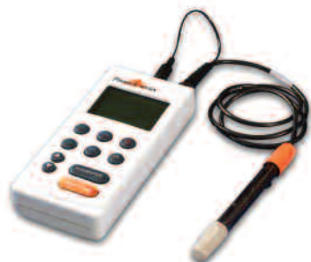
Model 314iP Portable: Sealed case, ISFET technology

Please see the Selection Guide on page 28 to choose the appropriate meter for your needs.