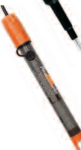
High-Performance pH Electrode Two replaceable junctions for consistent, rapid response