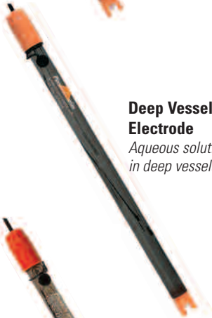
Deep Vessel pH Electrode Aqueous solutions in deep vessels