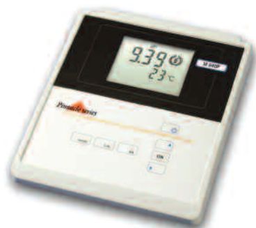
Pinnacle Model 540P