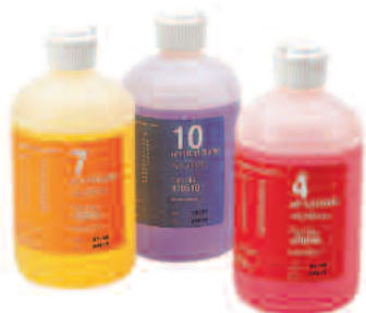
Bottled Buffers in 4, 7, and 10.01 Values

Please see the Selection Guide on page 28 to choose the appropriate meter for your needs.