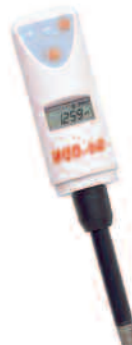
Chek-Mite DUO-60 Measures pH with conductivity, automatic calibration, read, and ATC