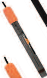
Gel General Purpose pH Electrode Ideal for aqueous samples; low maintenance