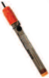
Flat Surface pH Electrode Small, semi-solid samples