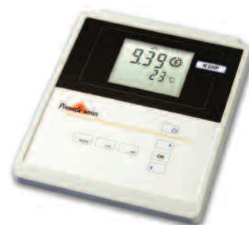
Pinnacle Model 530P