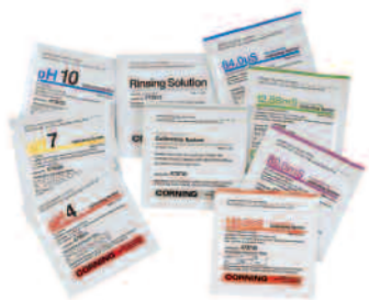
Buffer and Rinsing Solution Sachets

Nova also offers starter kits as an optional accessory for meter-only purchases. Starter Kit A (catalog number 470124) includes an electrode arm, a storage bottle, and buffer solution sachets (three of each value—4, 7, and 10.01). Starter Kit B (catalog number 470125) includes all of the items found in Starter Kit A, plus a temperature probe.