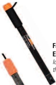
Fast-Flow pH Electrode Ideal for samples that clog rapidly