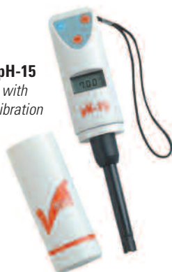
Chek-Mite pH-15 Measures pH with automatic calibration and read

This dual-purpose tester measures pH and conductivity. With automatic calibration, automatic endpoint, and automatic temperature compensation (ATC), the Chek-Mite DUO-60 tester offers high-level performance at a low price.