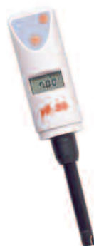
Chek-Mite pH-20 Measures pH with automatic calibration, read, and ATC

The Chek-Mite line also includes inexpensive hand-held testers to measure conductivity (CD-30—see page 12); temperature (TMP-55—see page 14); total dissolved solids (TDS-35—see page 12).