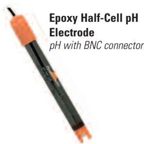
Epoxy Half-Cell pH Electrode pH with BNC connector

Please see page 25 for calibration buffers and other accessories.