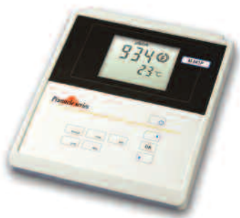
Pinnacle Model 541P