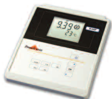
Pinnacle Model 545P