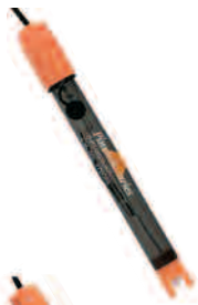
General Purpose pH Electrode General use and aqueous solutions