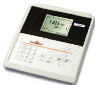
Pinnacle Model 555P

Sophisticated software and microcomputer technology make the Model 545P Meter our most flexible meter. Special user functions, such as the data logger, selectable high/low alarm in pH mode and timer, among others for GLP, suit this meter for high volume quality control laboratories to research facilities developing the latest scientific discoveries. Automatic and manual temperature compensations give the operator more control, and automatic read and end-point sensing combine to reduce the number of keypad operations required for calibration and sample measurement. A self-