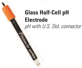
Glass Half-Cell pH Electrode pH with U.S. Std. connector

Our rugged bulb pH electrodes are designed to provide rapid and reliable pH results. The specially formulated glass membrane responds to hydrogen ion activity by developing an electrical potential across the membrane. The potential inside the pH electrode is fixed by the buffered pH filling solution. The potential of the separate reference electrode (see below for reference electrode units and features) is also constant. Any change in the potential of the electrical system is due to the pH of the solution, and is subsequently measured.