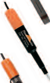
Gel Spear Tip pH Electrode Ideal for dense samples; low maintenance