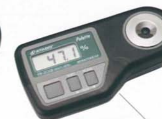
PR-201 \alpha Cat.No.3452