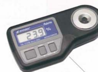
PR-101 \alpha Cat.No.3442