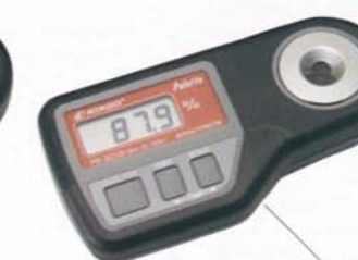
PR-301 \alpha Cat.No.3462