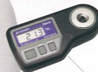
PR-32 \alpha Cat.No.3405

Four models of the Palette \alpha are available for your different measurement samples.